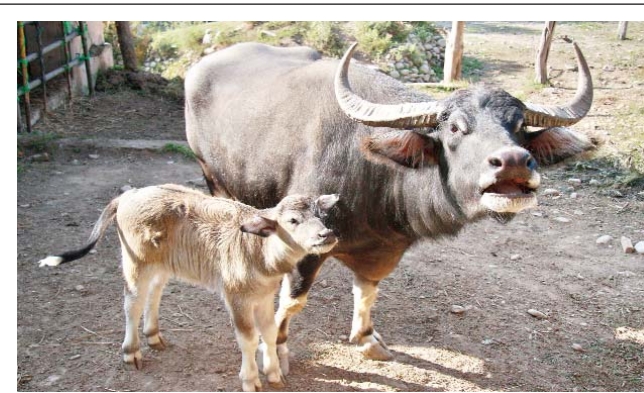
Shrawani with her calf at the central zoo.

At a time when the number of the wild buffaloes in the country is decreasing at an alarming rate due to increased poaching and cross-breeding with domesticated buf-