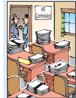
The honourable minister is still unable to find the right relative to fill the vacant post! What to do?