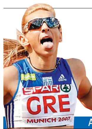
Athens hurdles champion banned Pg 8