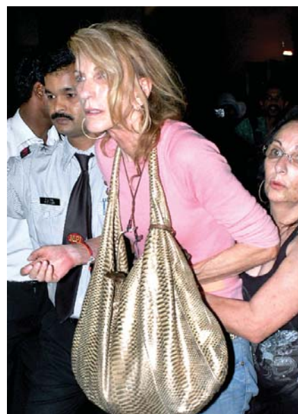
WORST NIGHTMARE: (From Left) Firefighters try to extinguish a fire as it engulfs the top floor of the Taj Mahal hotel, Indian nationals including journalists take shield at one of the attack sites in Mumbai and a guest at the Taj Mahal hotel being rescued. (Related story on Pg 6)