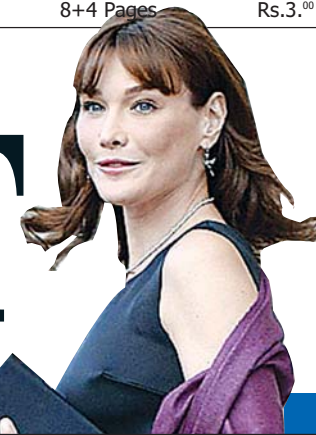
Bruni joins fight against AIDS City III