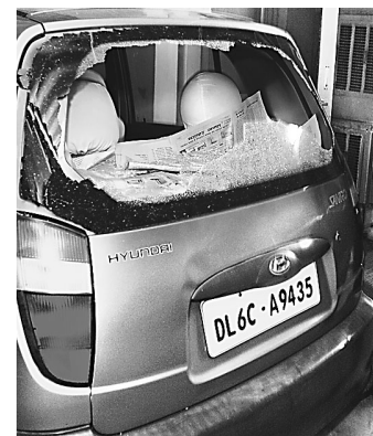
MP, Krishna Tirath's car that was allegedly 'shot at' by a bullet.